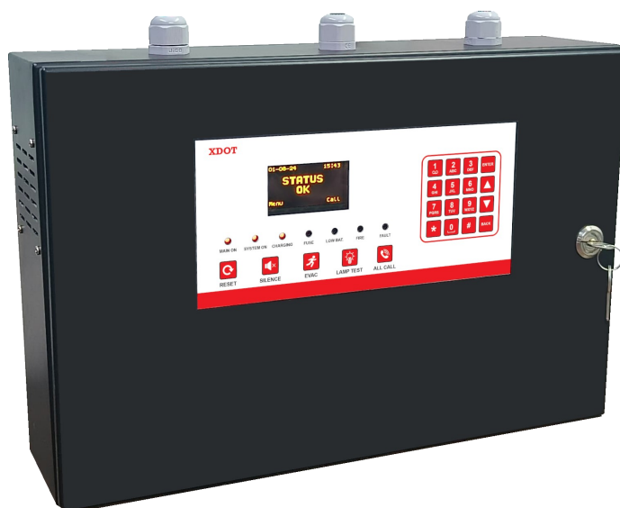
FIRE ALARM CONTROL PANEL (Addressable)