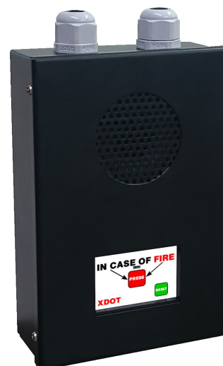
ZONE CONTROL UNIT (Addressable)